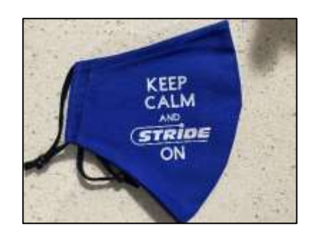
Keep Calm and STRIDE On face mask.